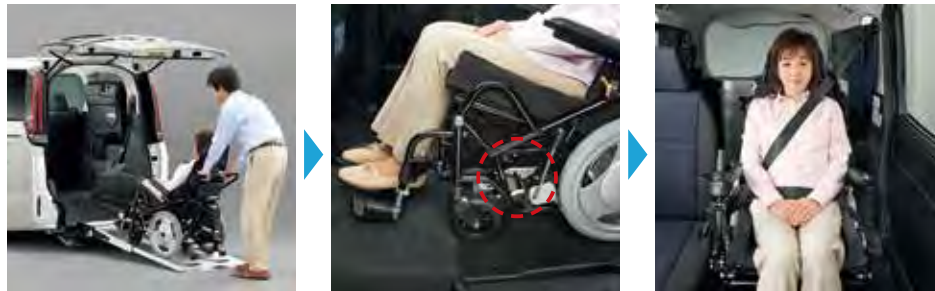
Motorized assist function

This Welcab feature was newly added to the Voxy, Noah, and Esquire.