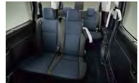
Inside the cabin of the Weljoin