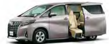
Side Lift-up Tilt Seat vehicle (Alphard)