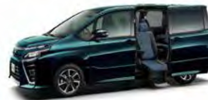
Side Lift-up Tilt Seat vehicle (Voxy)

The Welcab product line included 43 models in 23 vehicle series